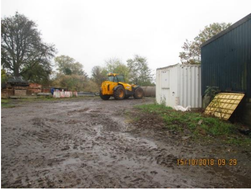
East boundary of farm yard