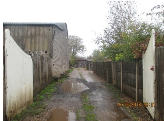
Southern boundary of site (rear of main shed)

2.1 Southfields Farm is located north of Common Lane in Bramcote within the Nottinghamshire Green Belt and the site area is 0.4ha in size. There are two large agricultural buildings and a grain silo within the farm yard. The site is generally used for storage. Access into the site is from Common Lane to the south west. Immediately south of the site is Southfields Farmhouse and three brick barn conversions which compromise dwellings: Hayloft Barn, Long Barn and Dairy Barn. The site is enclosed by a hedge, trees and vegetation. The fields to the north and south of the site are owned by the applicant.