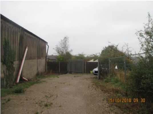
Southern view of entrance to farm yard