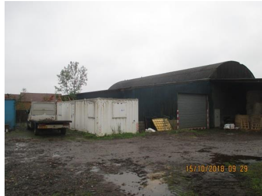
View of main shed