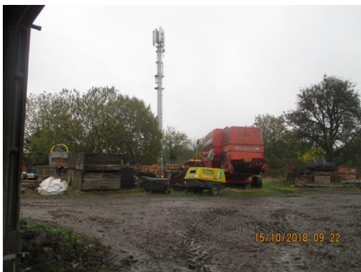
North boundary of farm yard